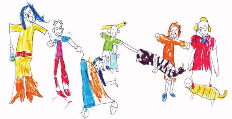
Open day - Sunday 23rd June 2013